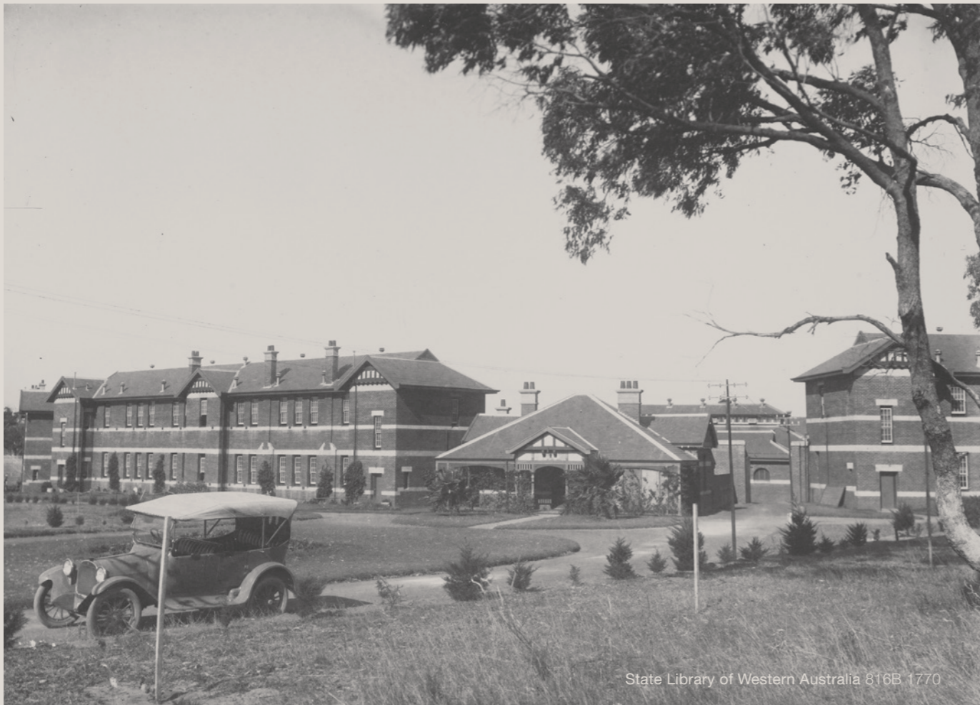
State Library of Western Australia 816B 1770